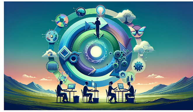
Generated image 3 through DALL-E