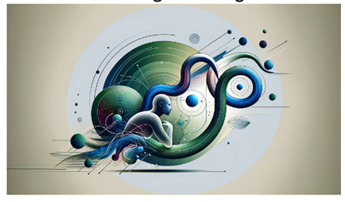
Generated final image through DALL·E