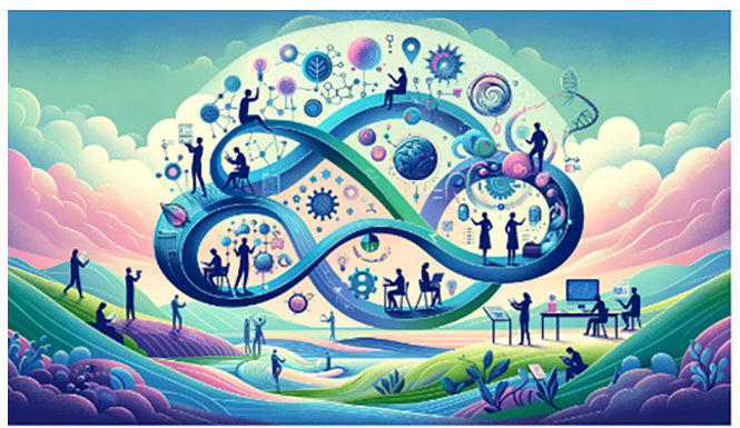
Generated image 1 through DALL-E