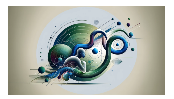
Figure 1: Image created by ChatGPT Dall.e: The promotional image has been adapted to include a serpentine form in the center, symbolizing the dynamic and interconnected nature of the human-centered research cycle in the development of new technologies. The generation process and prompts can be found in Section A.1.

interaction with conversational agents through LLMs [8], where the generated text is used as output. LLMs enable more fluid and contextually relevant interactions between users and virtual assistants in this context. The increased interest in applying GenAI for interactive systems has led to the rapid creation of personalized visual models [4], anticipating the increased adoption of GenAI for future interactive systems. Furthermore, LLMs can be used to produce source code for rapid software prototyping. Yet, several challenges regarding the correctness of such generations arise that need to be addressed carefully [6]. This is essentially true to ensure scientific integrity when AI-powered systems are used for tasks like paper reading assignments [2], writing [13], or reviewing [7].